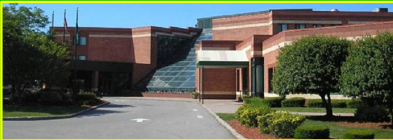
Maniwoc's Premier Hotel & Convention Facility